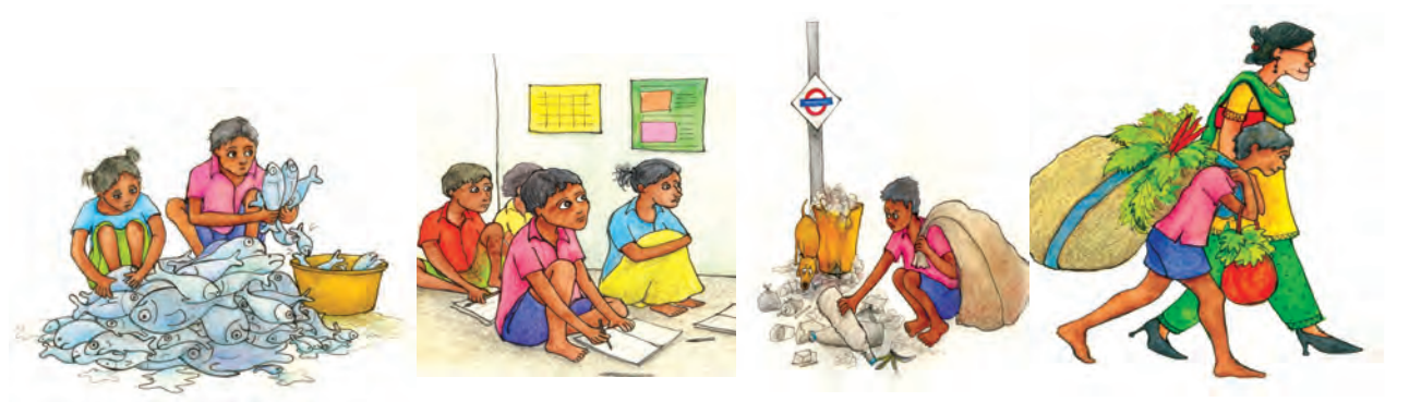
different. The day would pass running around for work, but the evening brought back old memories.