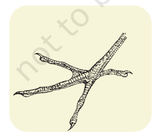
To hold the tree branches