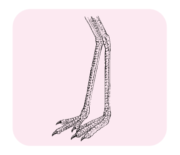
To walk on the land