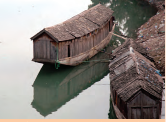
Many families in Srinagar live in a 'donga'. These boats can be seen in Dal Lake and Jhelum river. From inside the 'donga' is just like a house with different rooms.