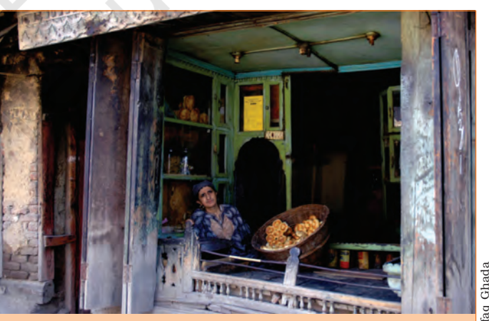
Can you tell what is shown in this picture? Every lane in Kashmir has a bakery. Kashmiri people don't cook roties in their homes, they buy it from such bakeries.