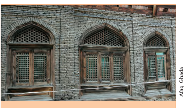
The old houses here are made of stone, bricks and wood. The doors and windows have beautiful arches ( mehraab ).