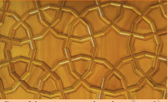
Beautiful carving on wood can be seen on the ceiling of houseboats and some big houses. This design is called 'khatamband', which has a pattern that look like a jigsaw puzzle.