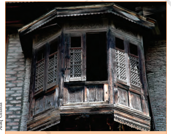
Some old houses have a special type of window which comes out of the wall. This is called 'dab'. It has beautiful wood pattern. It is wonderful to sit here and enjoy the view!