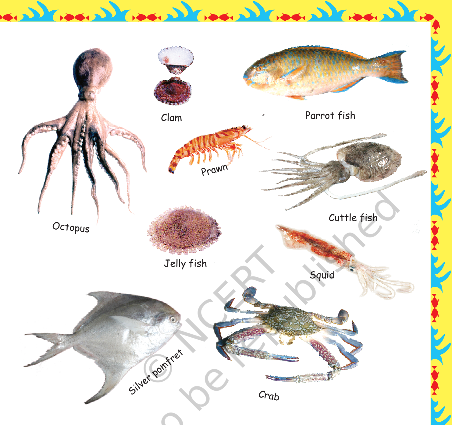
* Which of these sea animals have you seen before?