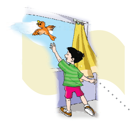
Unit 442–52Once I Saw a Little BirdMittu and the Yellow Mango