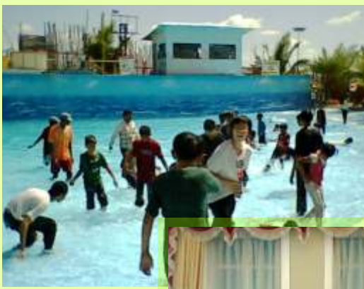
Splash on the beach front, Voila.. these waves seem real!!