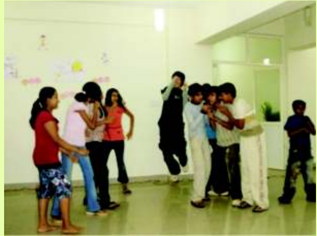
Students dancing on the tunes of Linkin park...